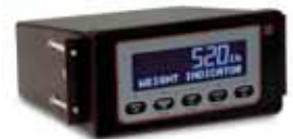
Desktop Panel Mount

*Stainless Steel Panel Mount and Desktop Panel Mount models are UL recognized in Canada and the United States.