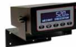
Desktop Wall Mount