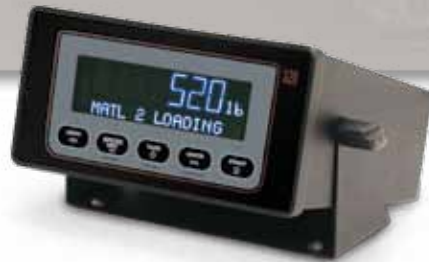
The 520 guides operators through weighing processes with a 16-character prompting display that can be programmed with up to eight different messages. Desktop model shown.

The 520—delivering process control solutions for today... and beyond.